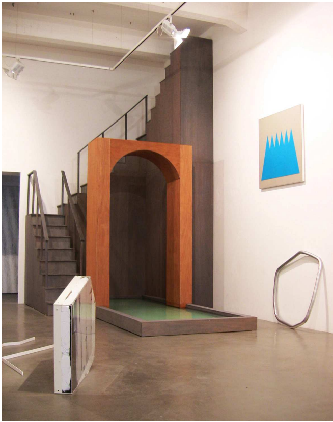
Creekside OPEN 2011 selected by Phyllida Barlow